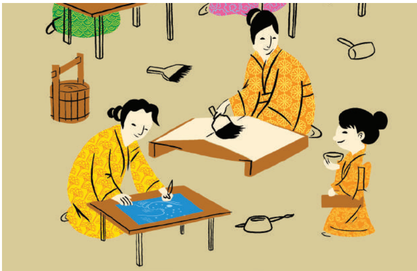
“I was written on papyrus and printed with ink and woodblocks...”