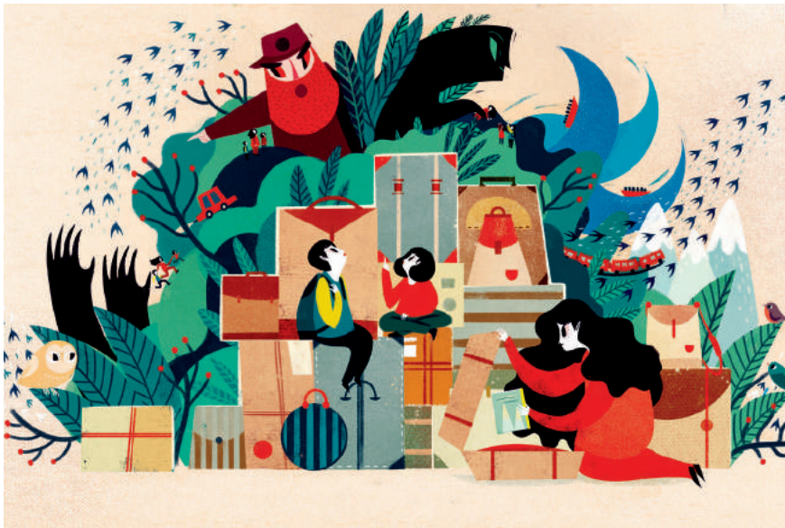
THE JOURNEY by Francesca Sanna

Freedom in Congo Square by Carole Boston Weatherford; illustrated by R. Gregory Christie. Slaves count down the days until they can meet in New Orleans' famed Congo Square—the only place they could legally worship and make music together.